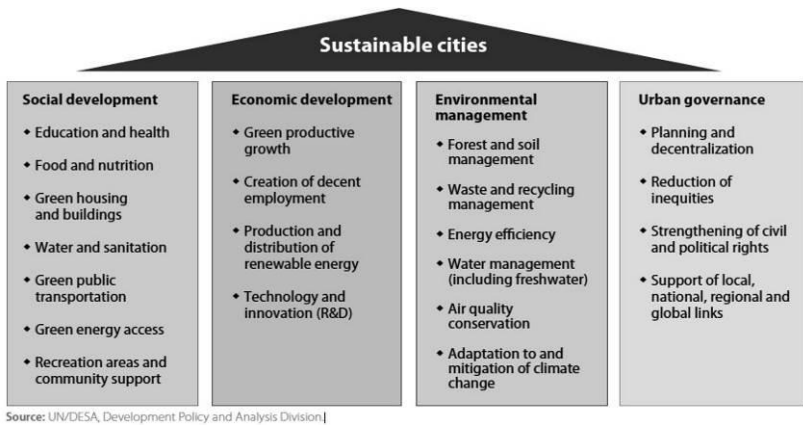
Figure 2. Pillars for Achieving Sustainability of Cities (UN, 2013, p. 62)

That both smart energy and greenways can play vital roles in achieving sustainable urban form will not surprise those of us who strive in various ways to create cities of the future, but merely including both in broader planning processes does not mean that they can be combined into synergistic relationships that contribute uniquely to achieving the goals of sustainability. There are several such relationships involving contributions that the two sides of this equation—smart energy and greenways—can make to one another as well as to sustainable and resilient urban form.